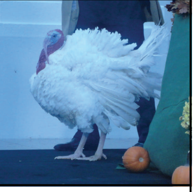
Popcorn at the White House 2013

One way the White House celebrates Thanksgiving is by parading two turkeys (one in front of the press and one behind the